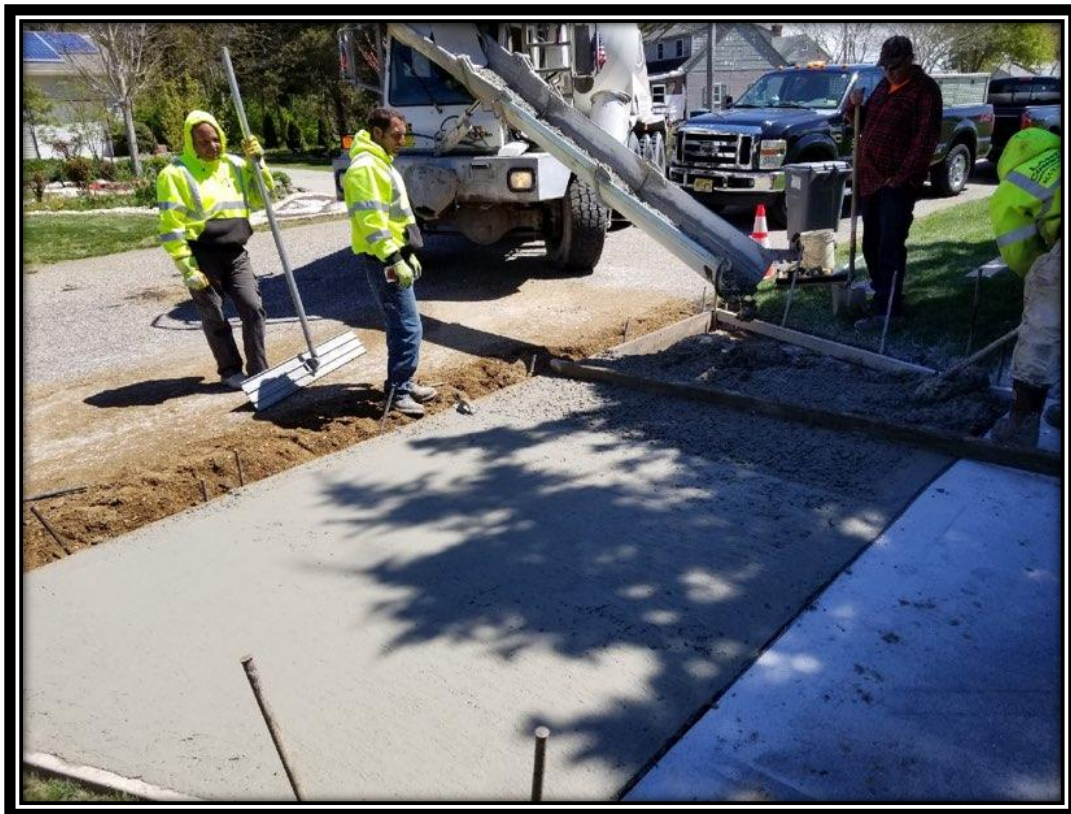
Figure: 1 – Installation of 6” thick, reinforced concrete driveway apron on Faith Run