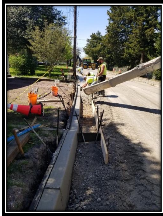
Figure: 2 – Installation of concrete curb on Church Street between North Boyd Street and North Main Street