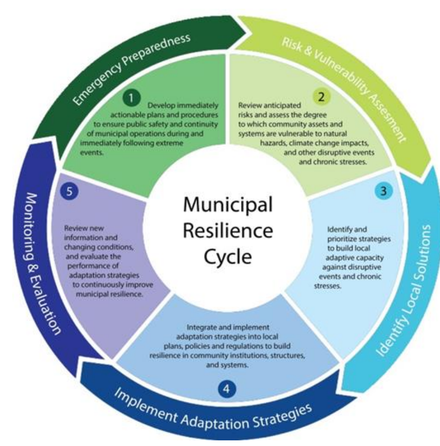
Figure 1. Municipal Resilience Cycle (Sustainable Jersey, 2014).

Sustainable Jersey defines municipal resilience as "the ability of a community to adapt and thrive in the face of extreme events and stresses." Through its municipal outreach and collaboration with partners across the state, Sustainable Jersey recognized the need