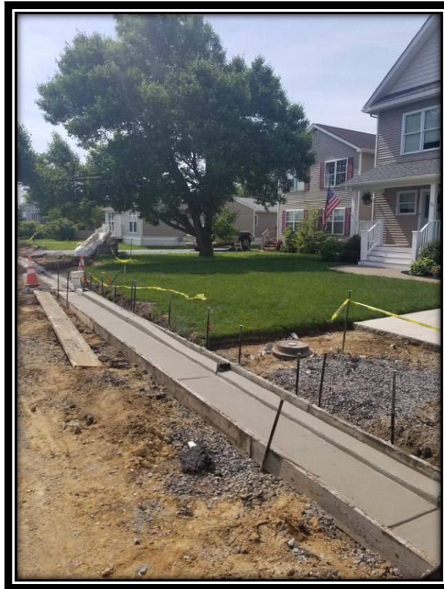
Figure: 1 – Installation of concrete curb and gutter on West Atlantic Avenue along the westbound lane between South Main Street and South Boyd Street