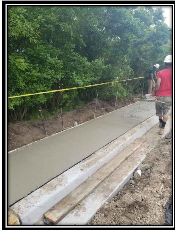
Figure: 2 – Installation of concrete sidewalk on West Atlantic Avenue along the eastbound lane between South Main Street and South Boyd Street