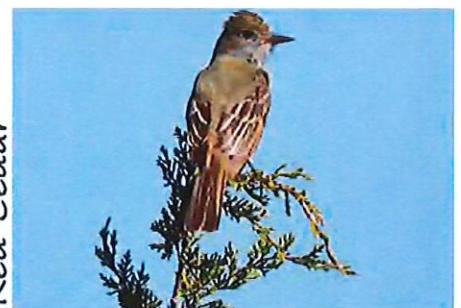
Juniperus virginiana (S C FS CV)

KEY: Tree (T) Shrub (S) Perennial (P) Fruit & Seed (FS) Caterpillars(C) Cover(CV)