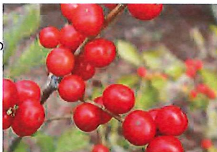
Ilex verticillata (S FS CV)