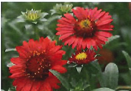
Gaillardia (P FS)