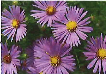
Aster novae angliae (P C FS)