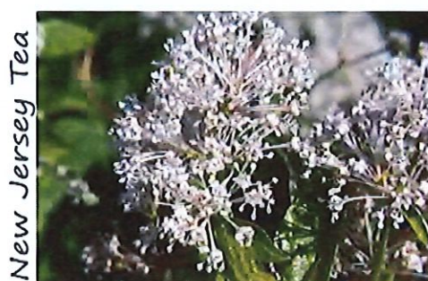
New Jersey Tea