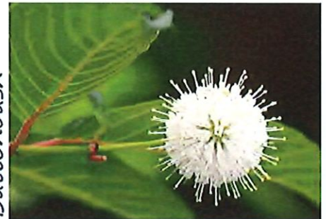
Cephalanthus (S FS CV)