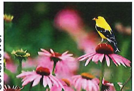
Echinacea (P FS)