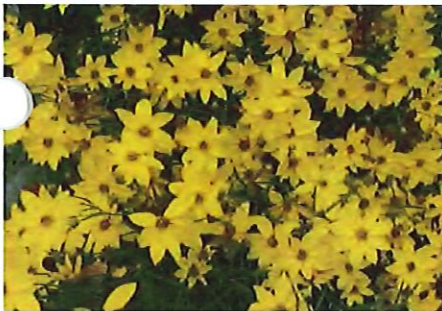
Coreopsis (P FS)