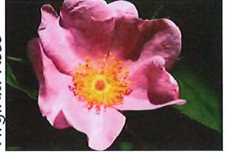
Rosa virginiana (S)