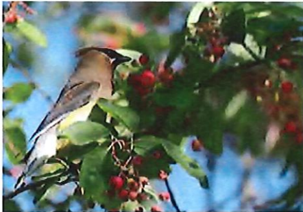
Amelanchier (T C FS CV)