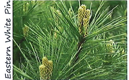
Eastern White Pine