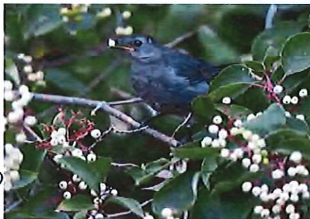
Cornus (S T C FS CV)